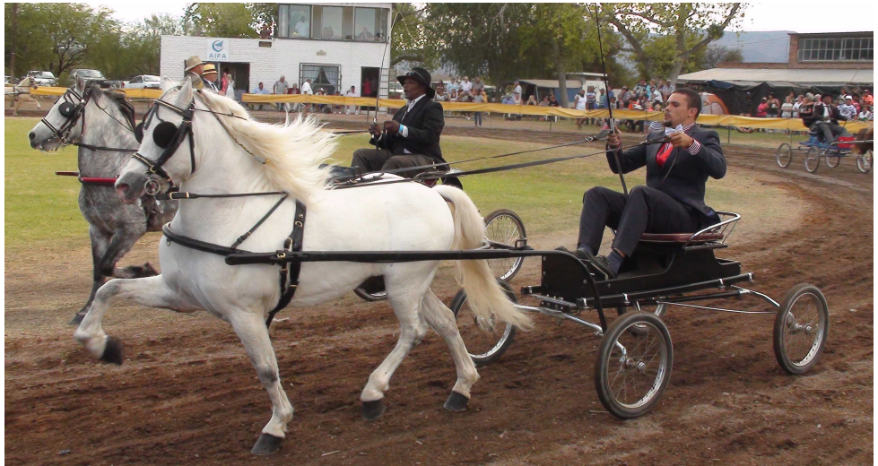
Daibu Showtime Parader – Supreme Single Harness

(Ed. The Breed Judge's Report will be published in the 2017 Journal, with photographs)