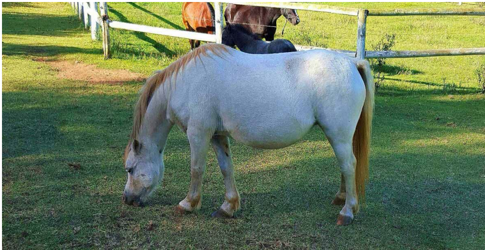
Paddock Hill Midnight Rose Pedigree below R5000